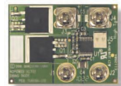
OR-ing Board Option