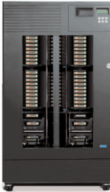
Qualstar 132 TB SAIT Tape Library

DALI has the ability to store and back up hundreds of thousands of maps for business continuity. With the exception of the UK the DGC is responsible for mapping all the earth's surface above sea level.