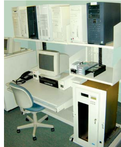
The compact size of Qualstar's TLS-8211 allows it to integrate easily into the Carroll College Data Center.

Carroll College is researching an upgrade to its storage topology, which would move it toward a network-based configuration. "Direct-attached storage has met our needs up to this point, but a SAN- or NAS-based solution seems to be a viable alternative as the school continues to grow," Corcoran said. "Qualstar's tape libraries have already proven their reliability and ability to grow as our needs escalate; we'll be looking at their products as part of our ongoing solution."