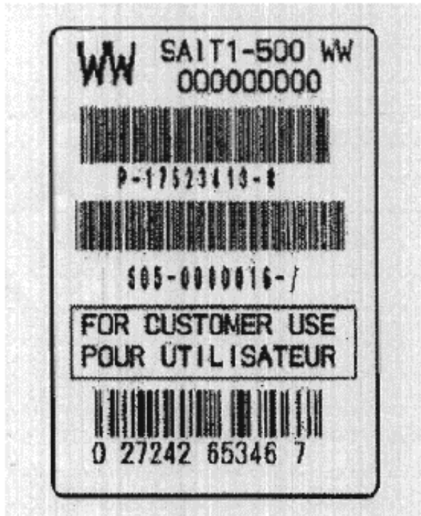
Type A Label